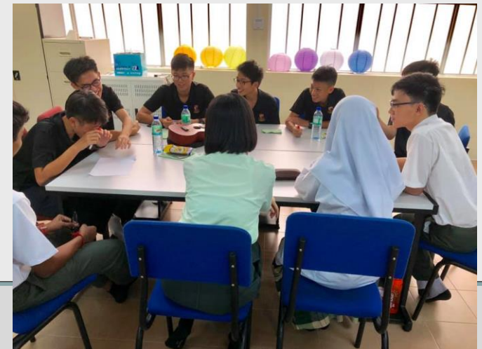
Y4 trip to Kuala Lumpur