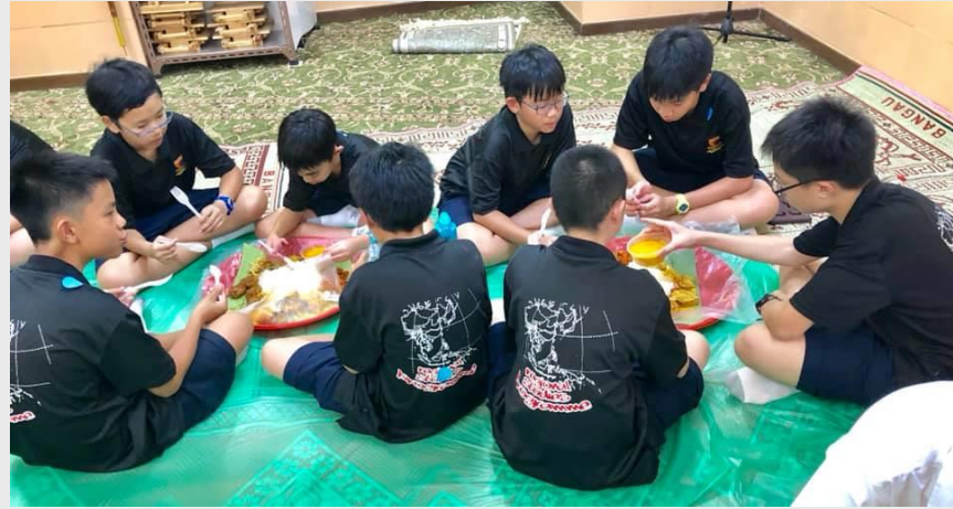
Y1s visit to traditional kampung at Lorong Buangkok