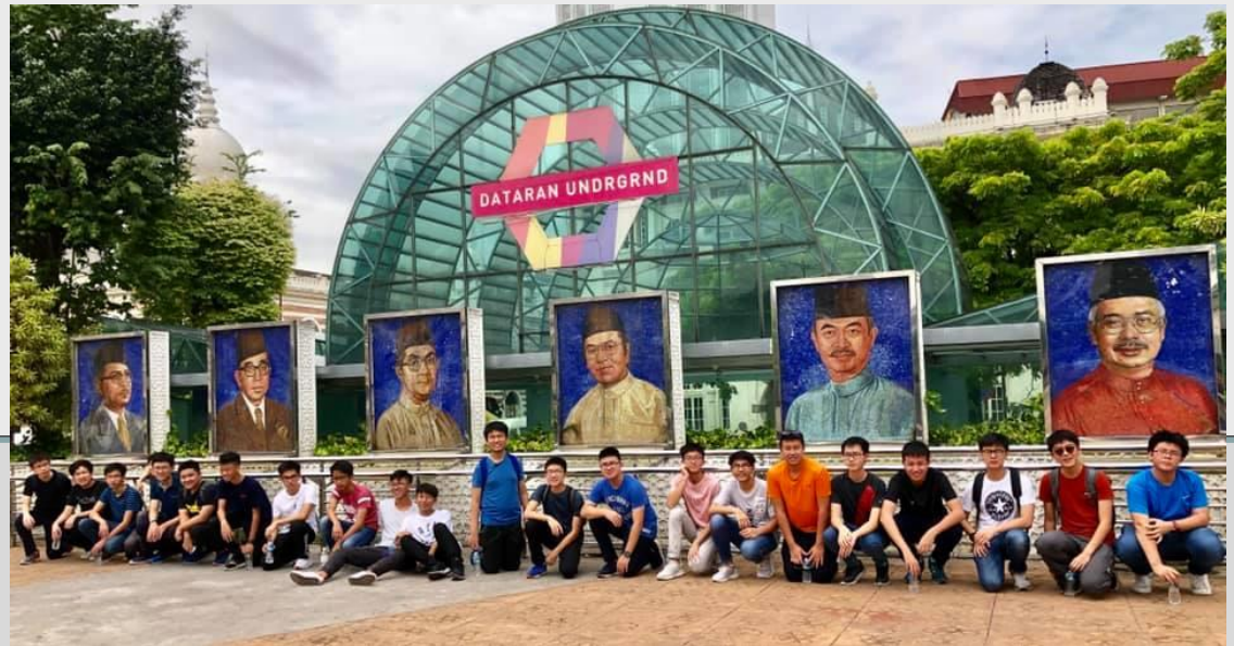
Y4 trip to Kuala Lumpur