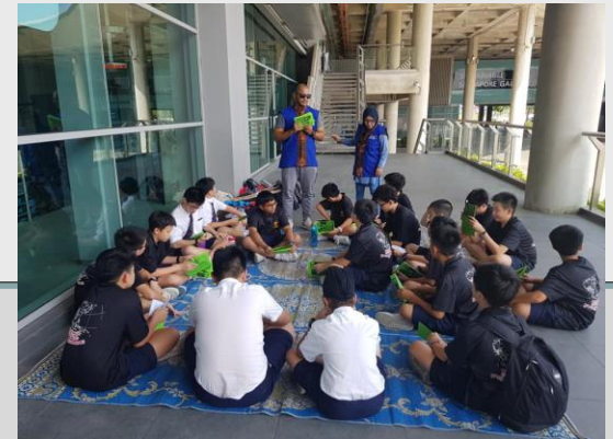
Y1s learning to make wau or kite