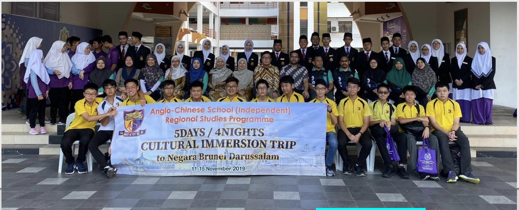
Y3 trip to Brunei

To nurture and prepare future leaders who can be more comfortable operating in the region