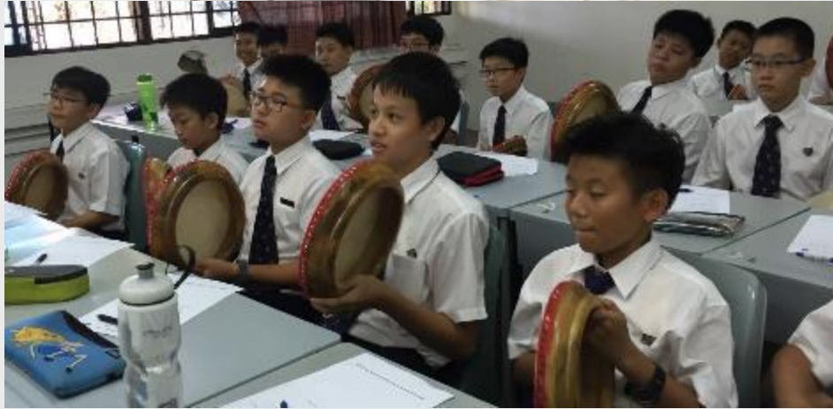
Y2s learning to play kompang