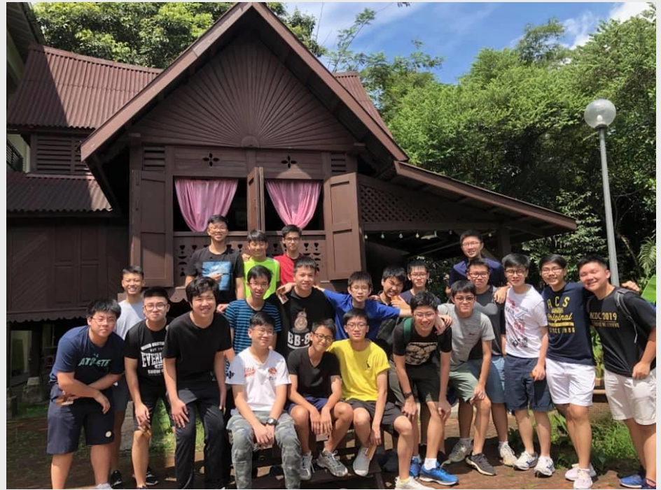
Y4 trip to Kuala Lumpur