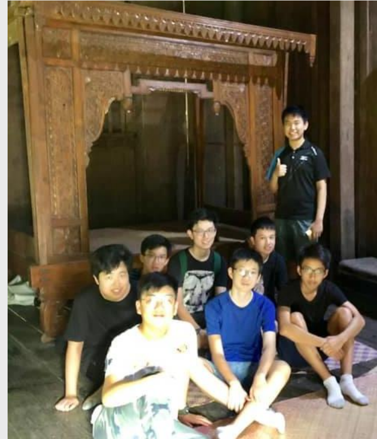
Y2 trip to Sarawak

NOTE : RSP lessons are curriculum lessons and take precedence over CCA activities and remedials unless students are representing the school in competitions