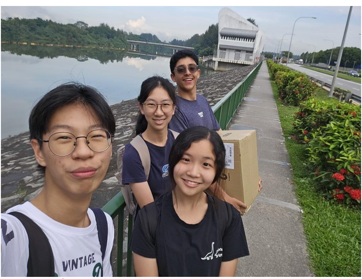
Our team of volunteers taking the scenic route to the dormitory