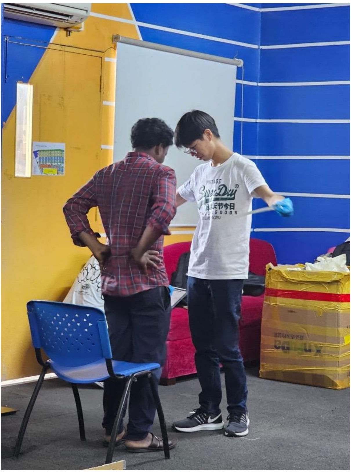
Conducting health assessments to ensure the well-being of our migrant workers