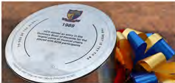
Close up of the 1989 medallion.