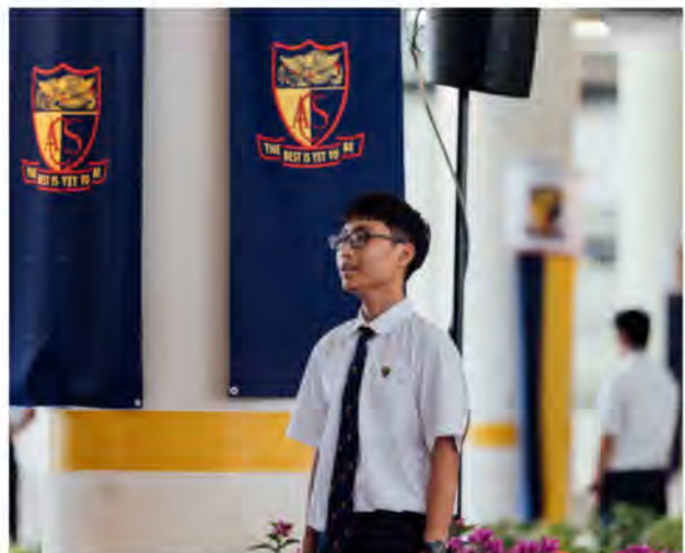
School Choir Performance at the roundabout.

Photos by Mr Richard Seow and the ACS(I) Photographic Society.